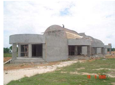
State of the Art Facility in Blowing Point

Phase on of the project is done. The building is complete and we are going to begin laying asphalt for parking and building the courts. We are hoping for the facility to be done by summer of 2006.