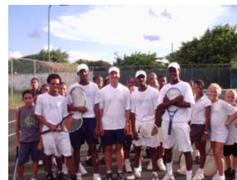
Coaches and Students in the After School Program