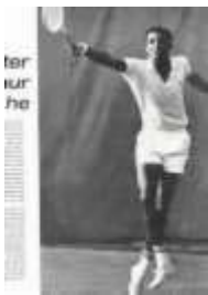
Arthur Ashe Was a pioneer in the World of tennis. He is a grand Slam champion and former Number one in the world.